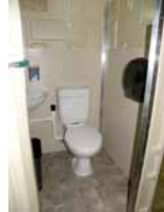
Model SJSDCS 520