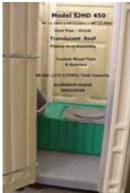
Model SJHD 450

SJHD 450 shipped ready to use – no wasted time spent waiting for supplies