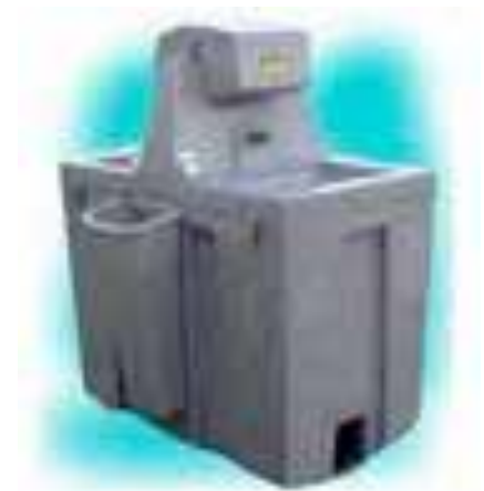
Hand Wash Station

The Model FPHW 4545 Dual Hand Wash Station is a stand-alone, self contained, with a 45 gallon (180 liter) fresh water supply. The dual hand wash station includes paper towel & soap dispensers and a wastebasket.