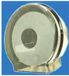
9" Tissue Holder

Every Sani Jon® can be shipped assembled with 9" Toilet Tissue Holder (with 9" tissue roll installed) and a starter supply of Portable Toilet Deodorizer (15 day supply, 2 services).