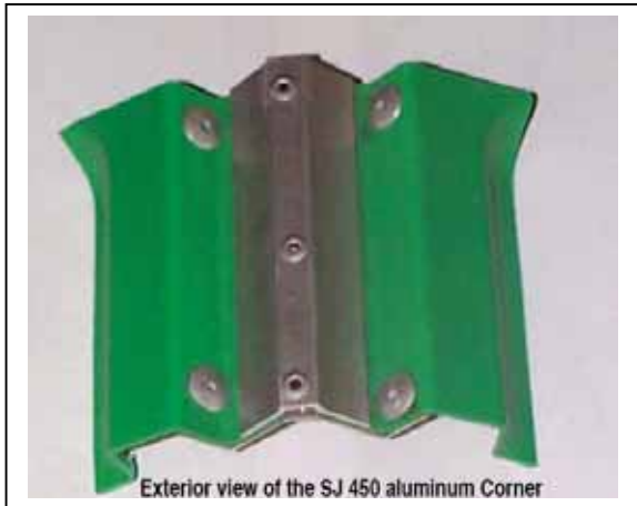
Outside Aluminum Corners for Long Life