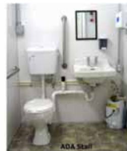
ADA Compliant Lavatory Building