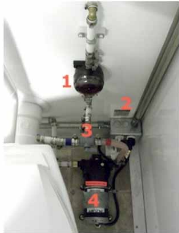
Water Pump System