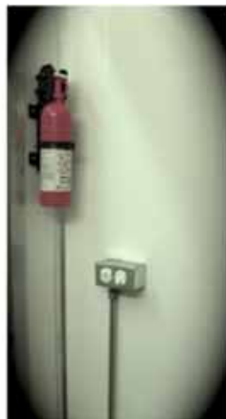
Light/Fan Switch Fire Extinguisher