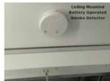
Ceiling Mounted Smoke Detector