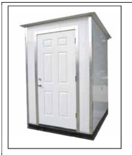
Single Stall Lavatory Building Dimensions: 7' x 7' x 7' 5"

The Single and Multiple Lavatory Buildings are Re-Locatable for Natural Disasters.